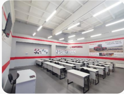
Kirovets Educational Space