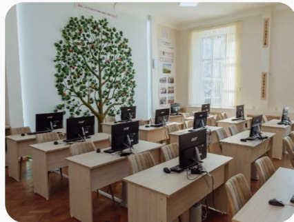
Educational space Ostrogzhskсадпитомник CJSC