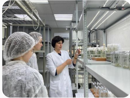
Training and production center for virus-free planting material