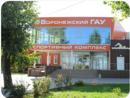
PHOSAGRO Educational Space