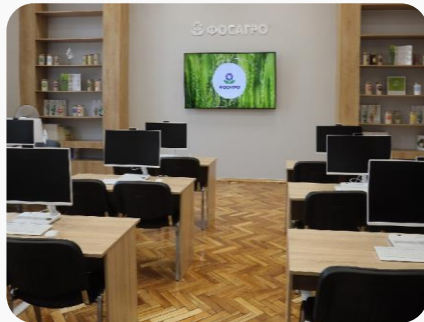
Voronezh SAU Sports Complex