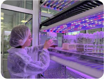
Modernization of the Biotechnological Research Center